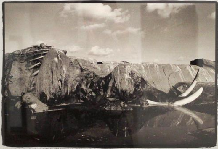
Walrus carcass on shore of the Arctic coast of Alaska. The tusks are the most valuable part of the animal. (See page 100 of the report.)