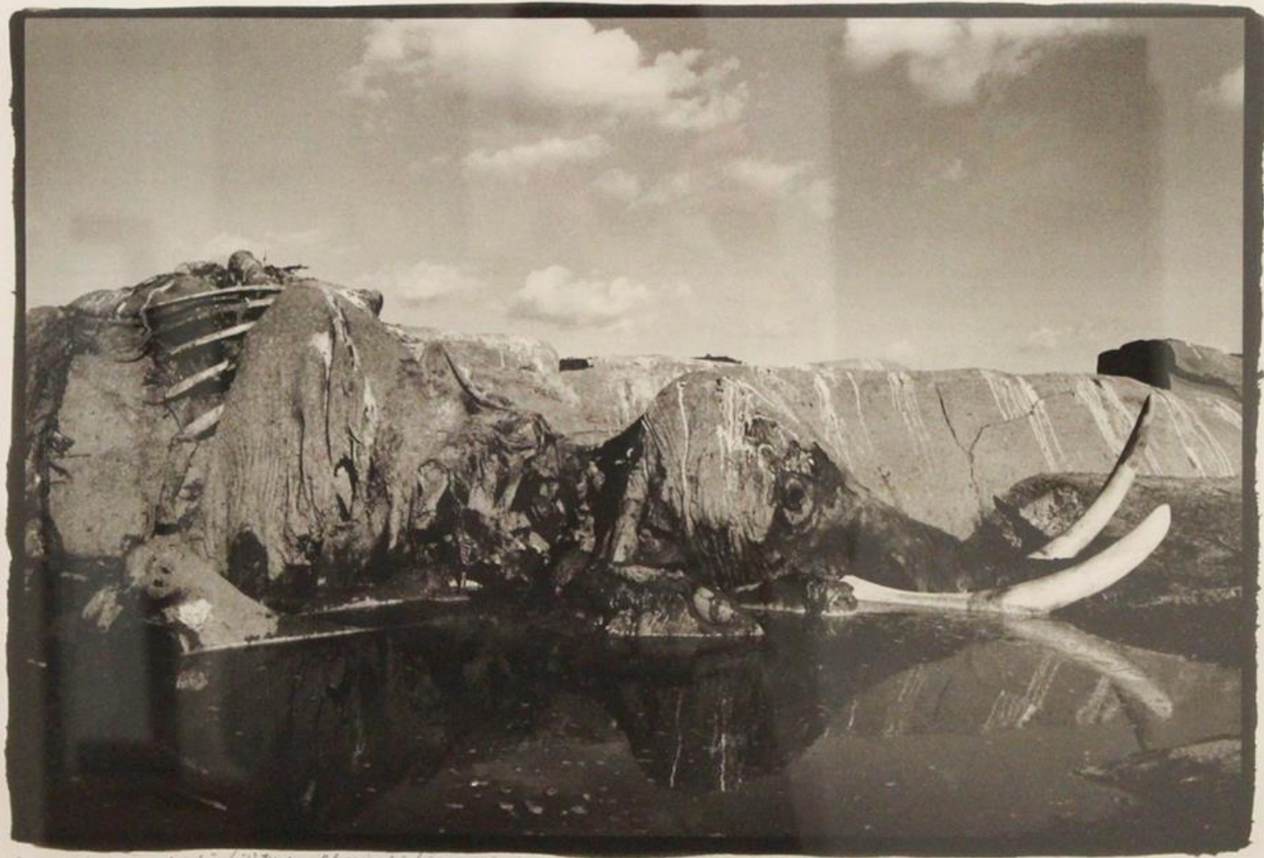
"Buy an elephant a drink" / Water for wild animals / STARVO with fish, mango / ELEPHANTS' MEMORY (1972)