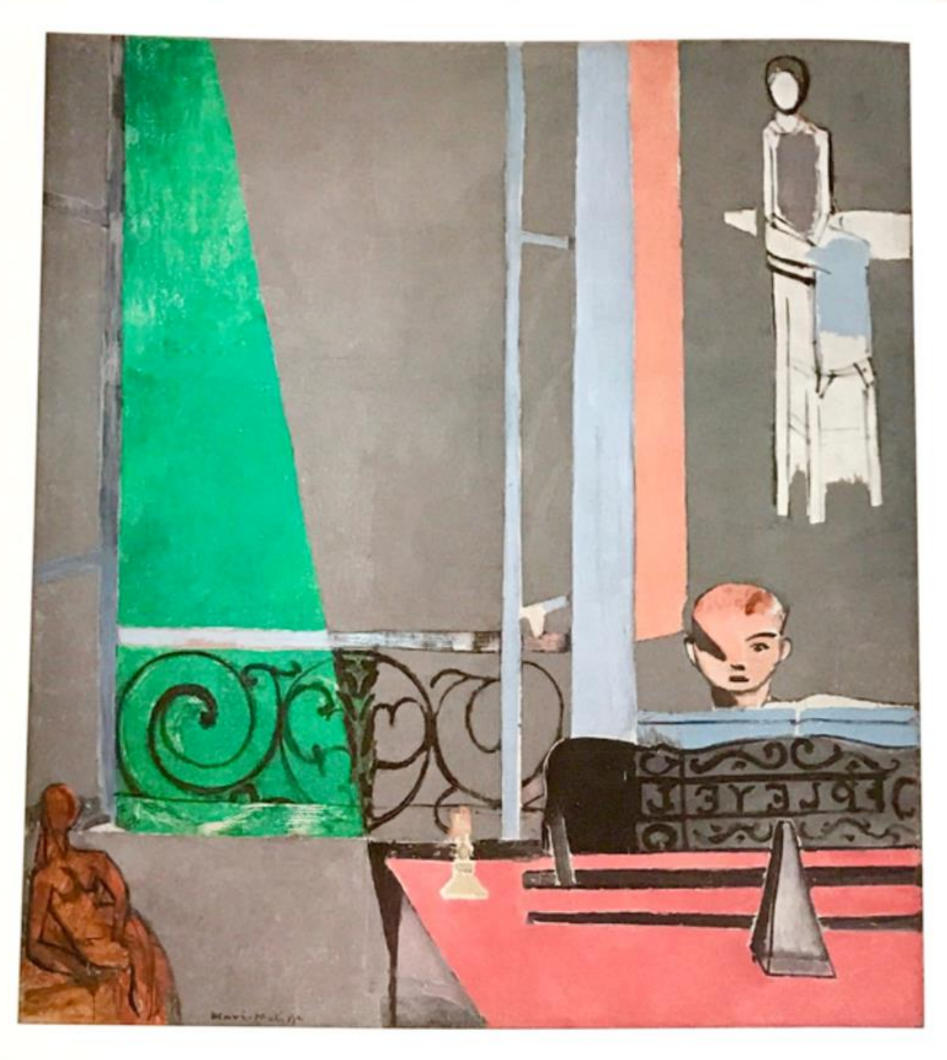
Plate 98. Henri Matisse, The Piano Lesson , 1916. Oil on canvas, 95\% \times 83 in. (245.1 \times 212.7 \text{ cm}) . The Museum of Modern Art, New York, Mrs. Simon Guggenheim Fund