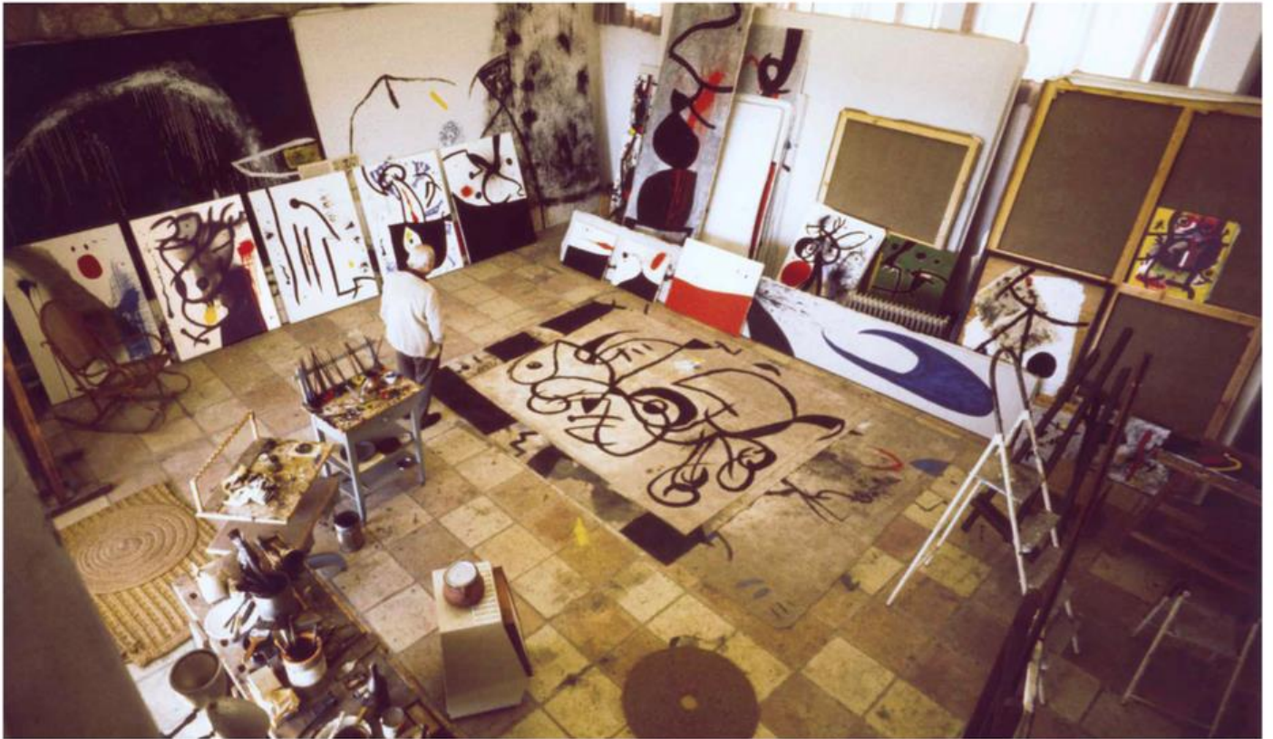
Miró in his atelier, after 1974